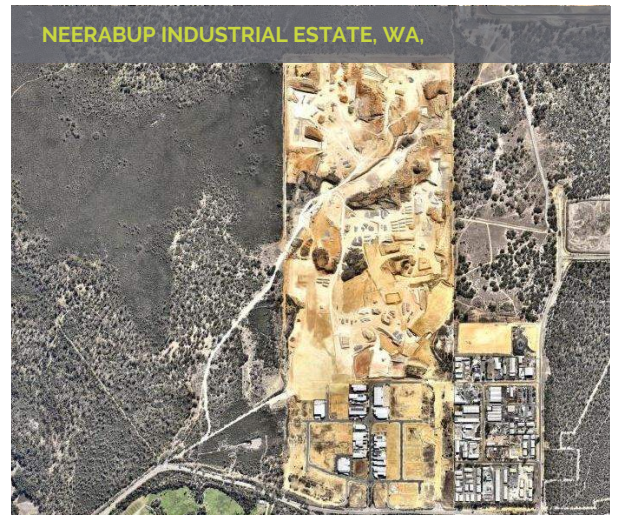
NEERABUP INDUSTRIAL ESTATE, WA,