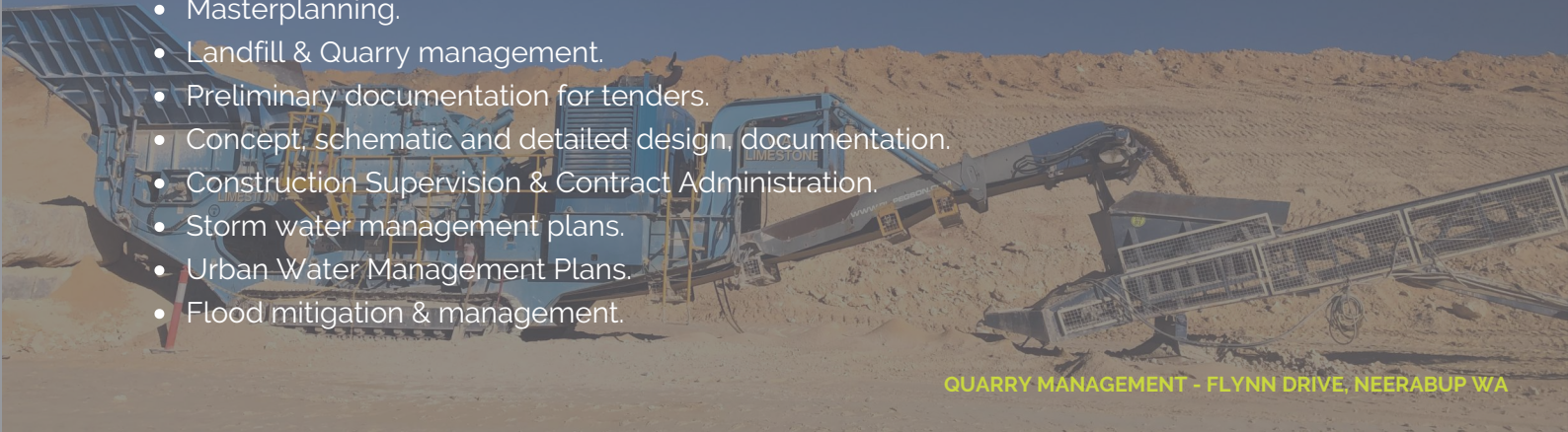
QUARRY MANAGEMENT - FLYNN DRIVE, NEERABUP WA