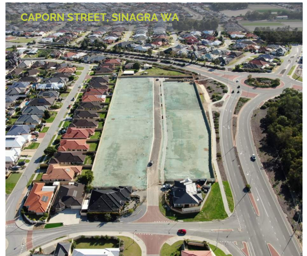
CAPORN STREET, SINAGRA WA