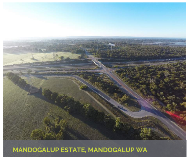
MANDOGALUP ESTATE, MANDOGALUP WA